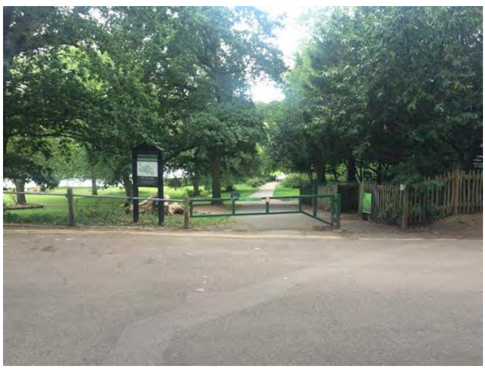
Figure 1 – Replace metal pole gate with timber gate (Note 1, appendix 3 - proposed layout)