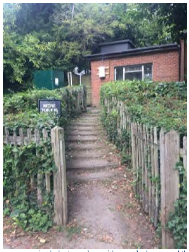
Figure 3 - Remove coppiced plants, replace with grass/hedge around the toilet block (Note 4, appendix 3 - proposed layout)