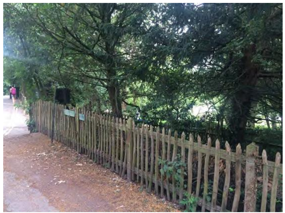
Figure 5 – Remove chestnut pale fencing and replace with timber post & rail (Note 6, appendix 3 - proposed layout)