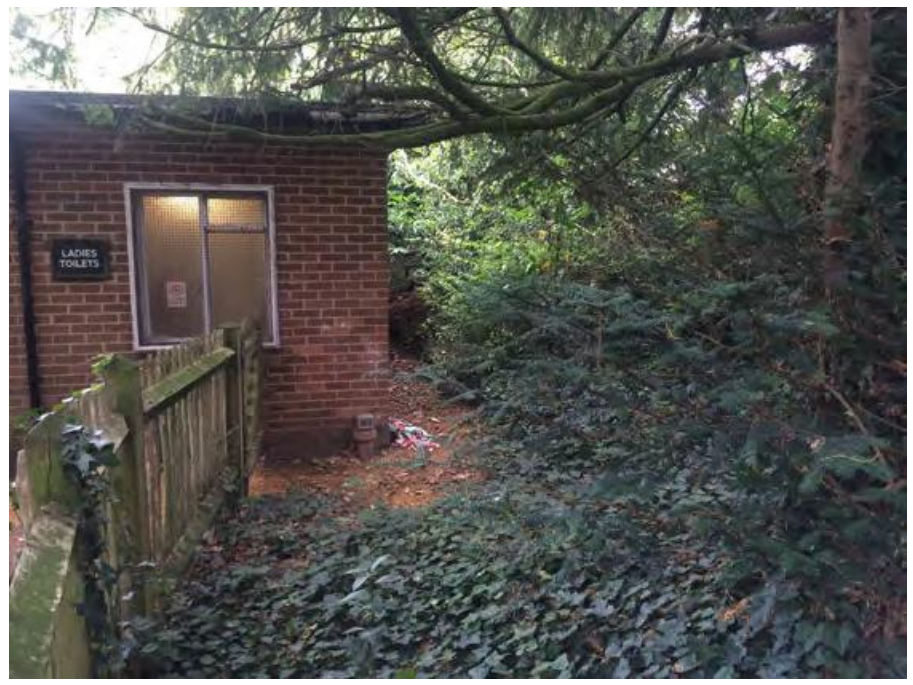
Figure 4 – Plant native plants - maintain as thicket max 1.2m high (Note 5, appendix 3 - proposed layout)