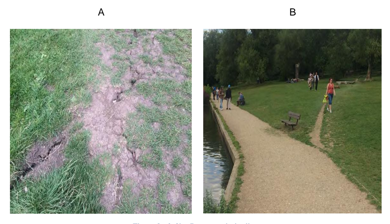
Figure 8a & 8b - Renovate desire lines (Note 12, appendix 3 - proposed layout)