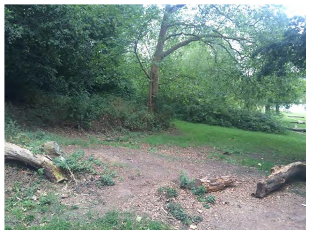
Figure 9 Reduce spread of willow clump to create views towards Pond (Note 13, appendix 3 - proposed layout).