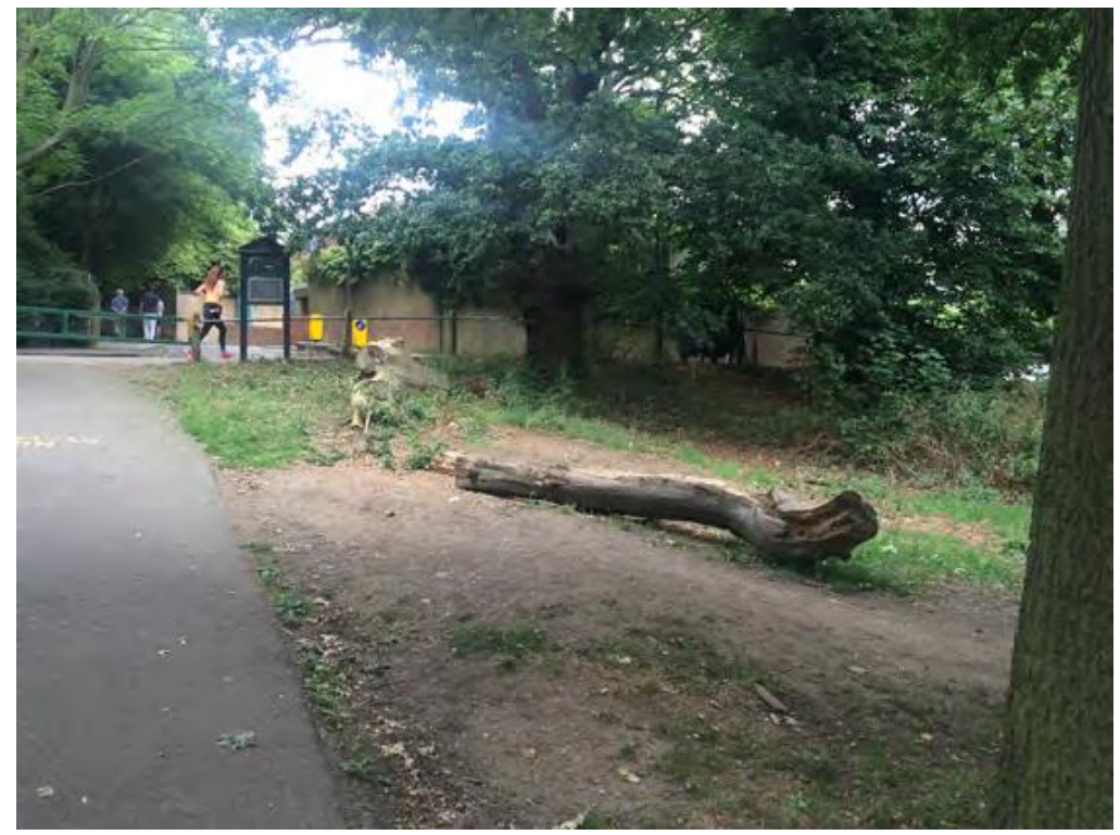
Figure 7 - Create an earth mound to discourage desire lines (Note 11, appendix 3 - proposed layout)