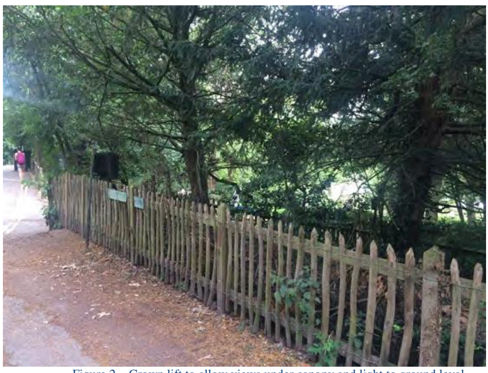
Figure 2 – Crown lift to allow views under canopy and light to ground level (Note 2, appendix 3 - proposed layout)