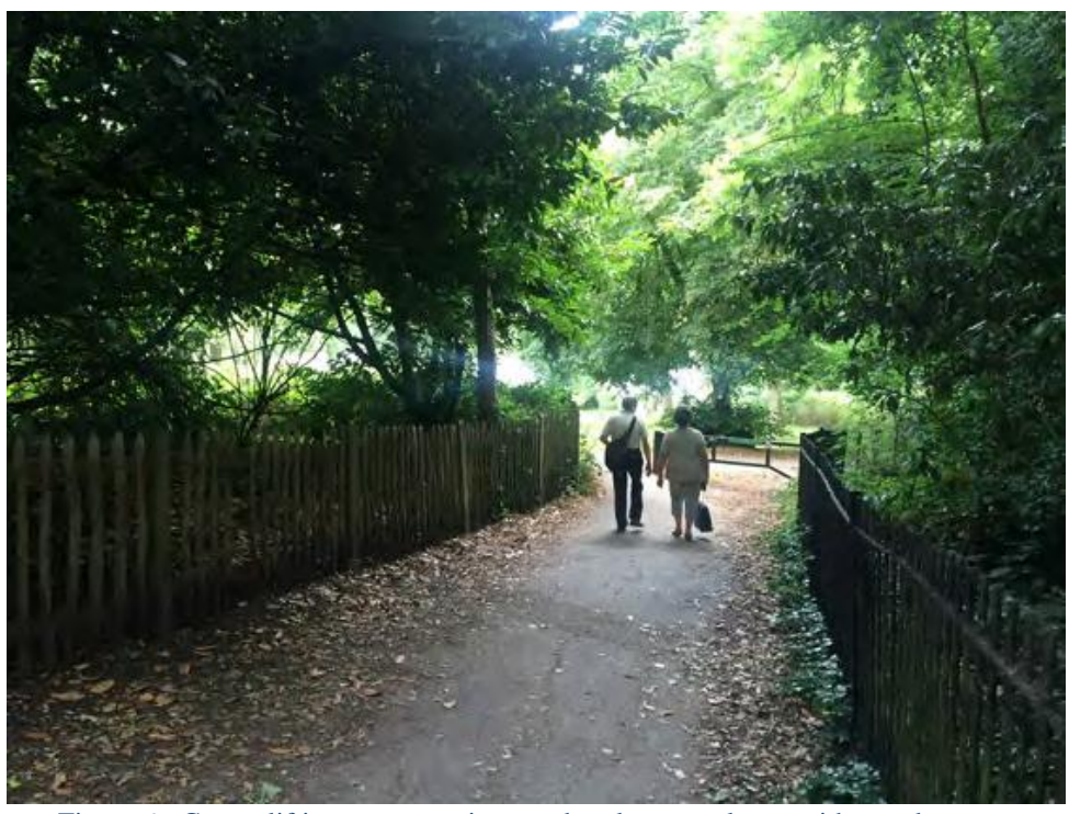
Figure 6 - Crown lifting to create views and replace metal gate with wooden posts (Notes 7 & 8, appendix 3 - proposed layout)